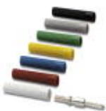
Insulating sleeve, Color: red